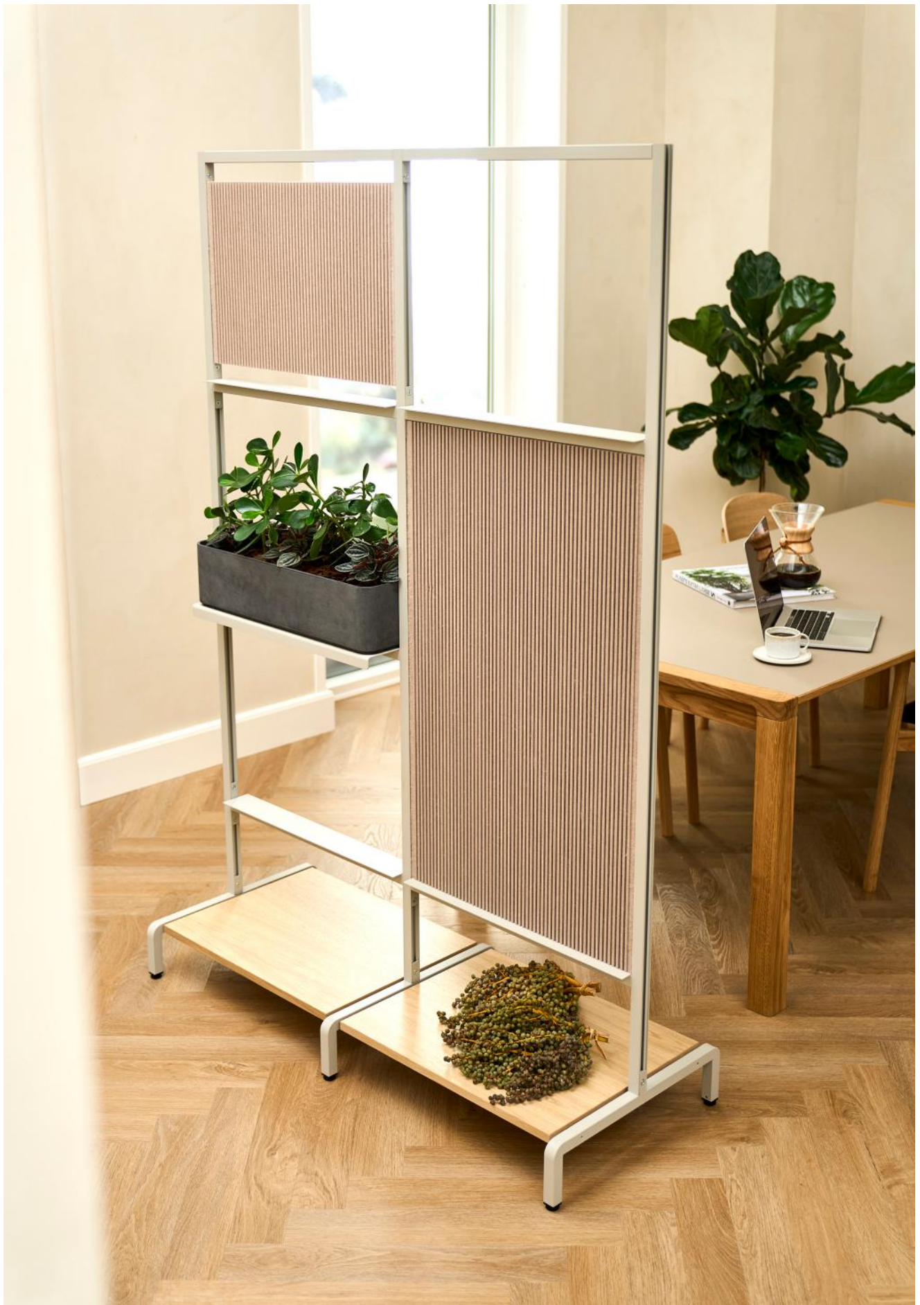
EXTEND DUO "ESSENTIAL" - SPECIAL COLOR