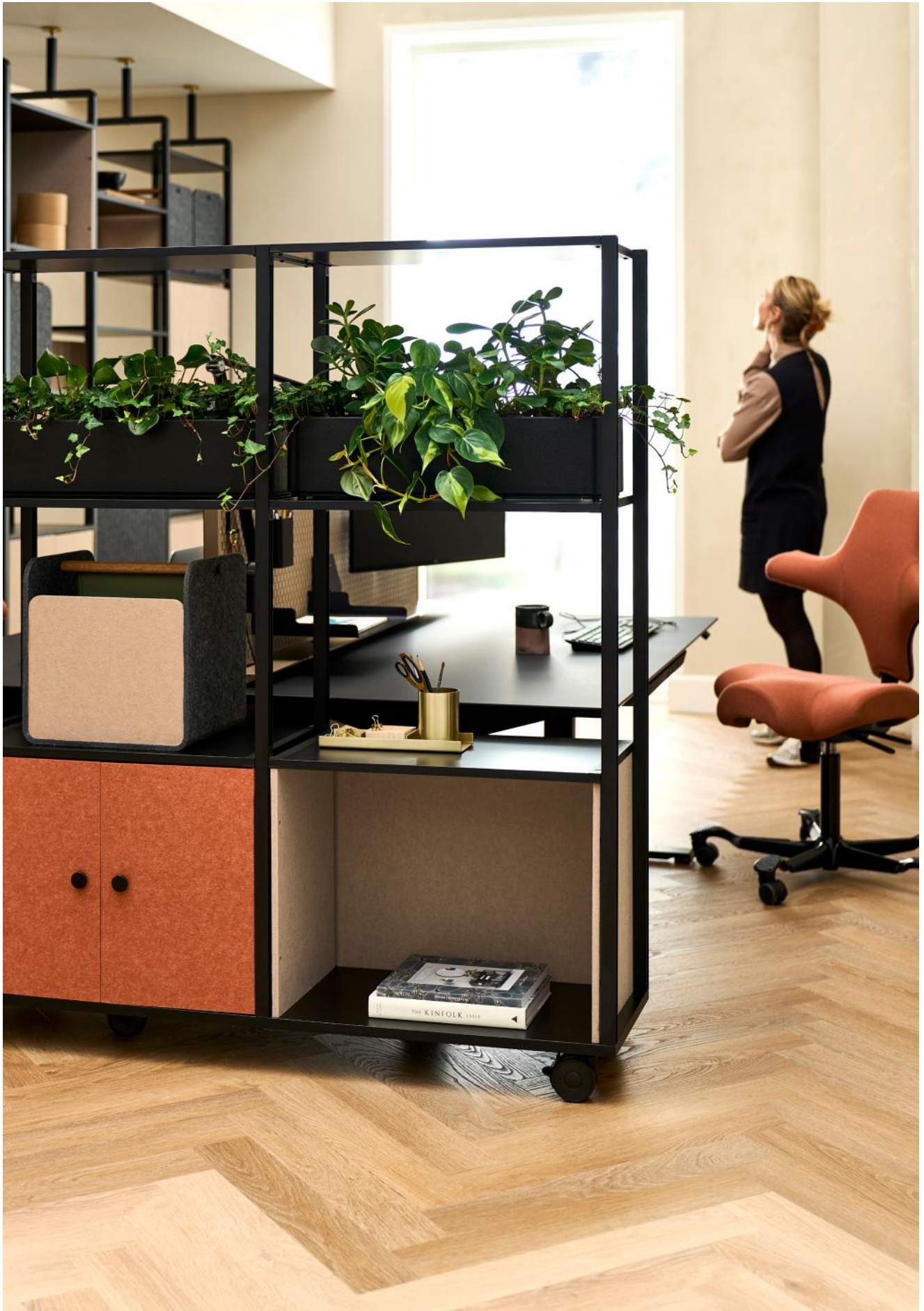
EXTEND ESPACO MOVEL WITH WHEELS AND MODULES