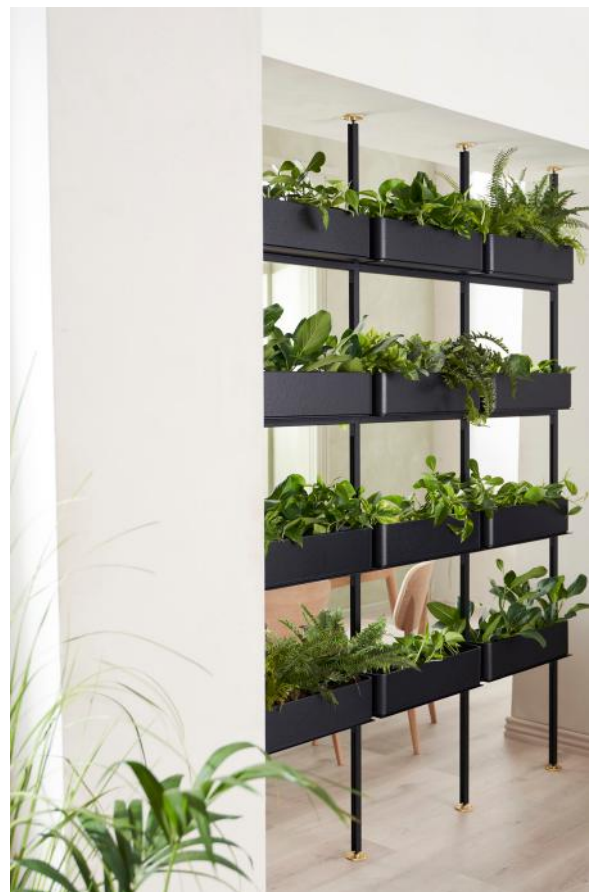
EXTEND CEILING MOUNTED