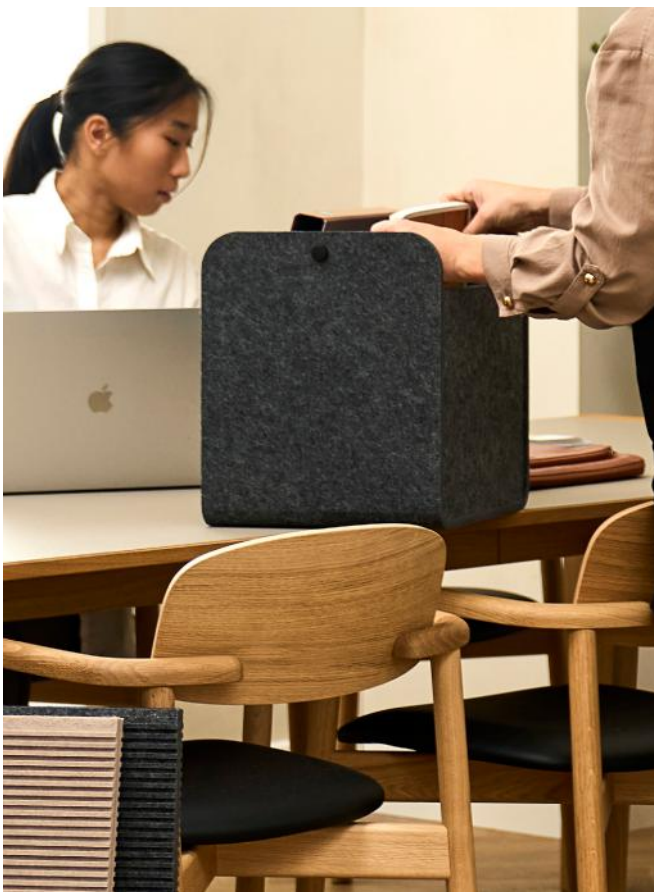
MULTI BOX "CARRY ON"