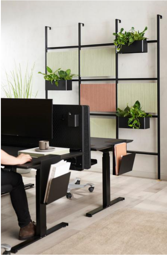
EXTEND WALL MOUNTED