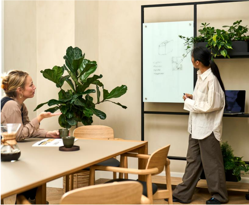
EXTEND DUO “ESSENTIAL” WITH OAK VENEER BOTTOM PLATES AND GLAS WHITEBOARD