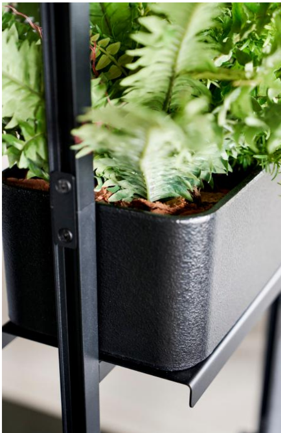
FLOWER BOX RECYCLED

Plants naturally enhance air quality by absorbing CO 2 and releasing oxygen, creating a fresher and more balanced environment.