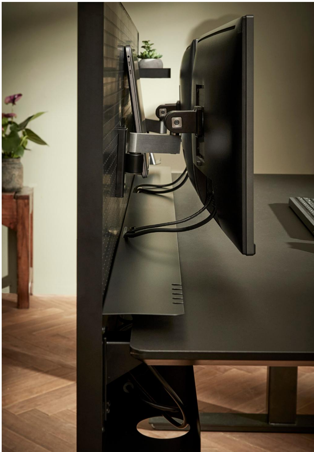
ADAPT BOARD 1300 MM. WITH MONITOR MODULES; SLIM SHELF AND LAPTOP HOLDER