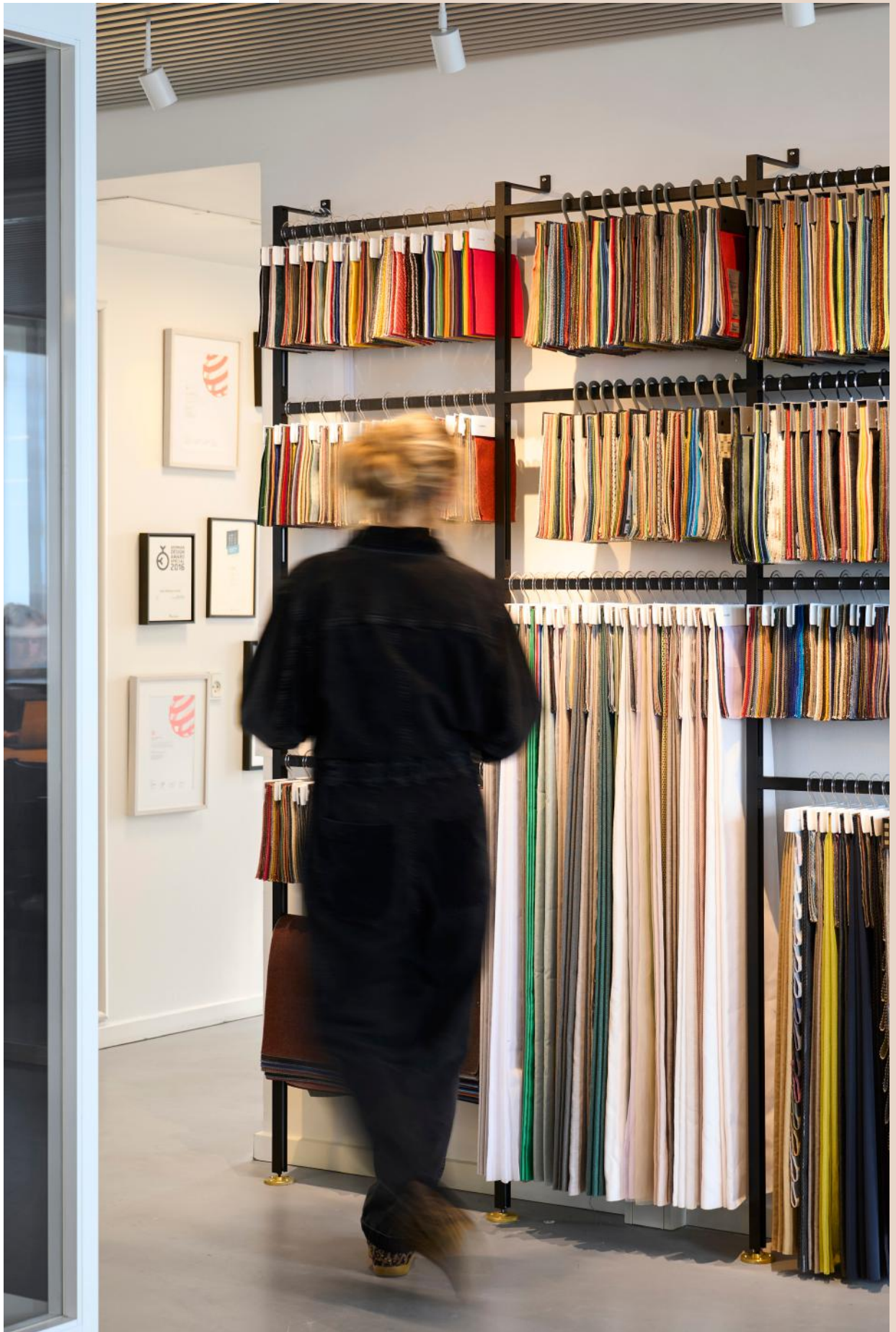
EXTEND WALL MOUNTED - C.F. MØLLER ARCHITECTS SHOWROOM