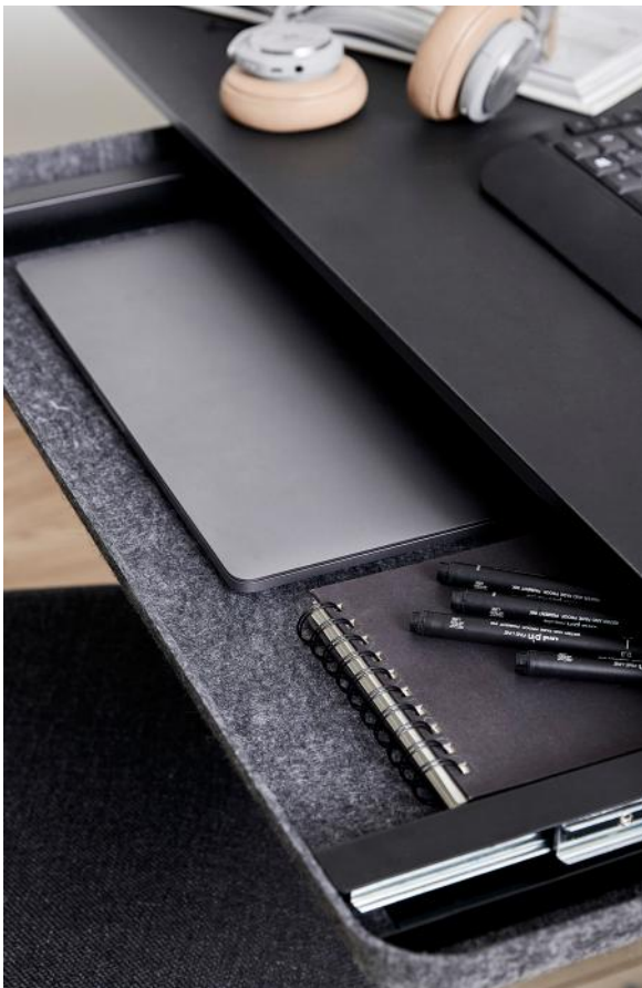
FELT DRAWER LARGE - DARK GREY

Our design is specifically optimized for flat packing, reducing CO2 emissions.