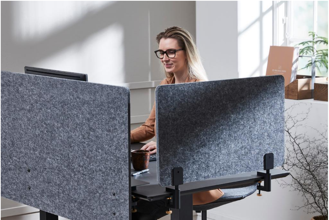
CLAMP CABLE MANAGEMENT AND WHITEBOARD SIDEWALL