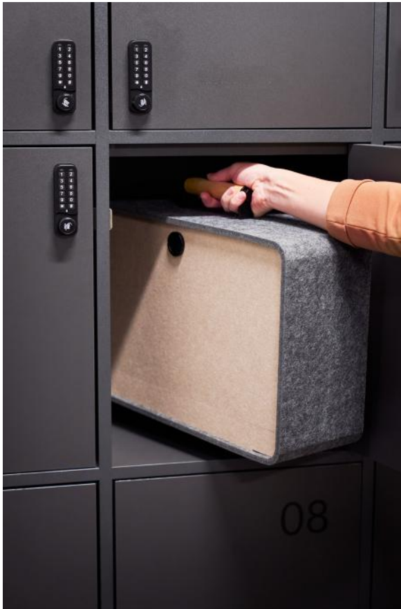
OFFICE BOX DARK GREY AND BEIGE