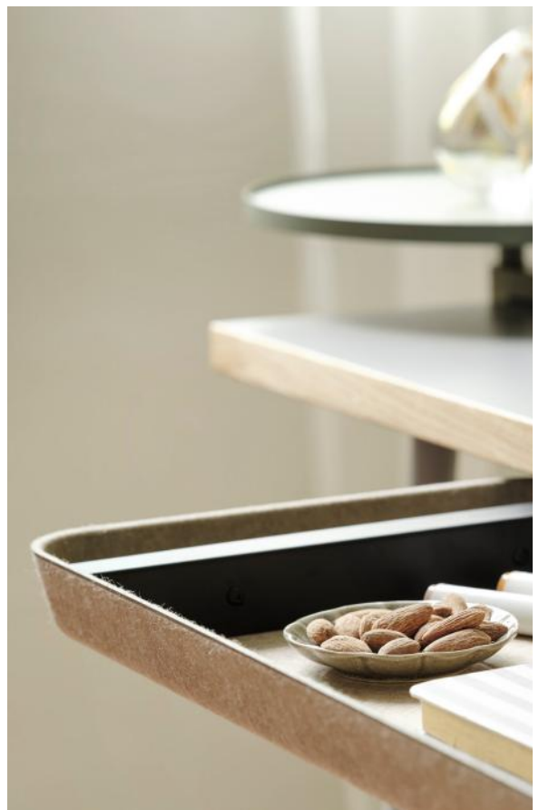
FELT DRAWER SLIM - BEIGE