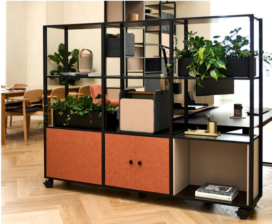
EXTEND ESPACO MOVEL WITH WHEELS AND MODULES