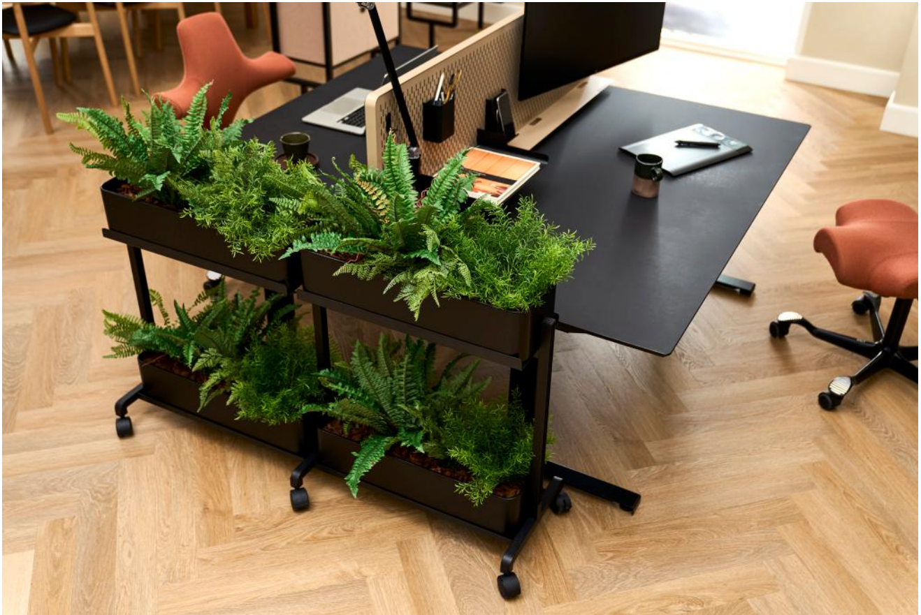
EXTEND DUO JUNGLA